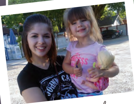
cute as can be