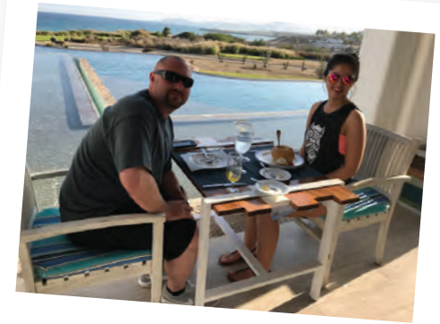
enjoying the view