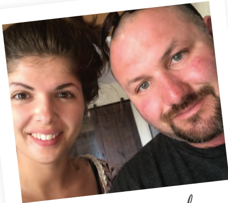
my best friend