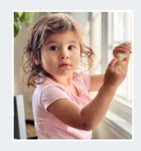
www. lifelong adoptions. com