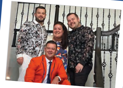
Always a blast!