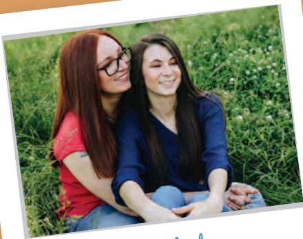
so much love