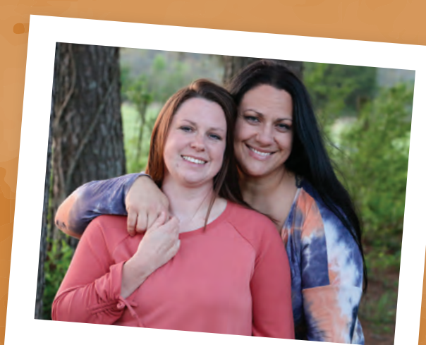
head over heels