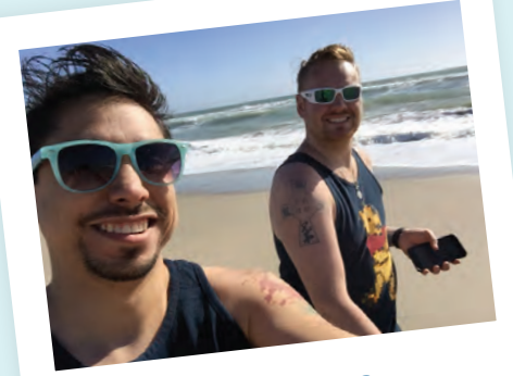
Together We Can