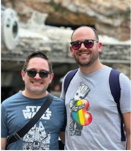
www. lifelong adoptions. com