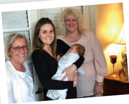
family is forever