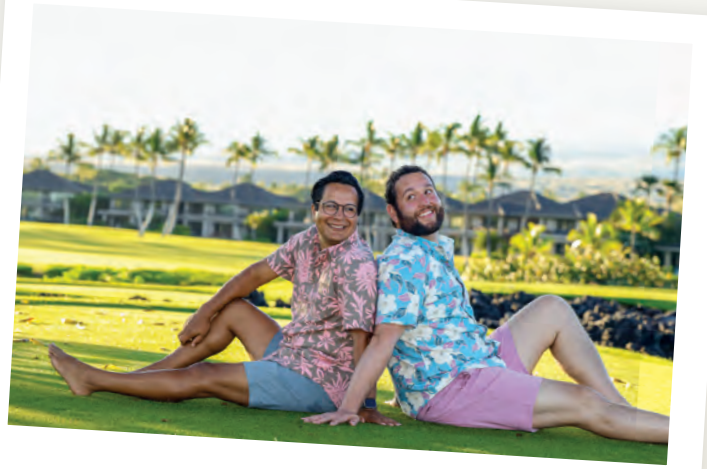
Together we can