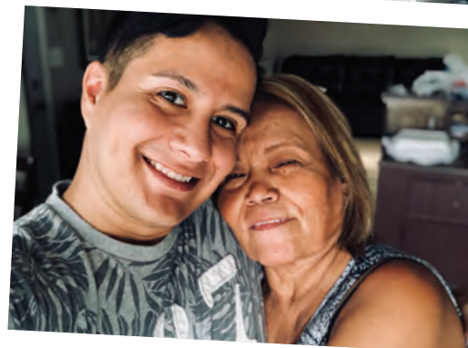
mother & son