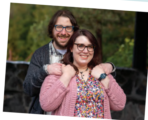
Hopeful future parents!