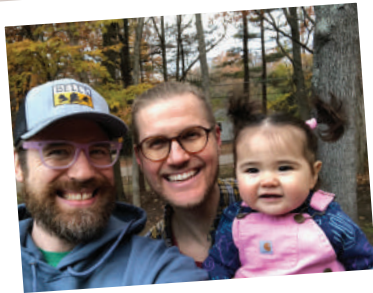
Hopeful big sister!